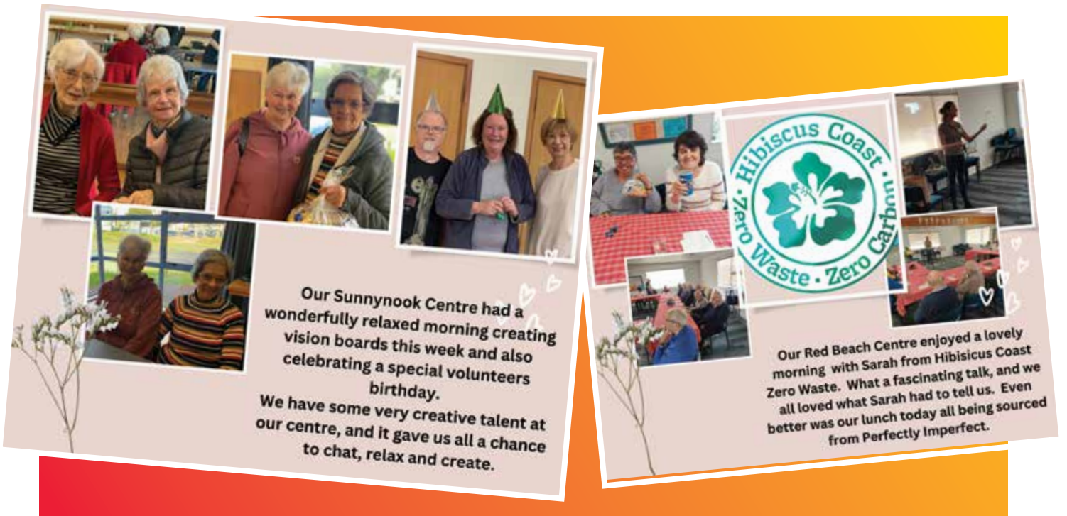
Our Sunnynook Centre had a wonderfully relaxed morning creating vision boards this week and also celebrating a special volunteers birthday. We have some very creative talent at our centre, and it gave us all a chance to chat, relax and create.

I really enjoy my daily walking in my local area, spending time in my kitchen (baking), I love reading, and am involved with the Yacht Club.