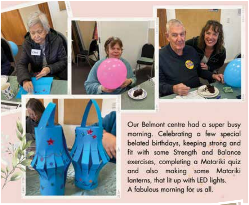
Our Belmont centre had a super busy morning. Celebrating a few special belated birthdays, keeping strong and fit with some Strength and Balance exercises, completing a Matariki quiz and also making some Matariki lanterns, that lit up with LED lights. A fabulous morning for us all.