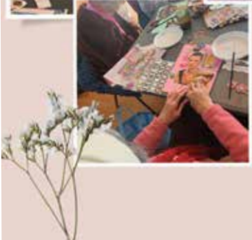
Our Birkenhead / Birkdale Centre had a wonderful morning creating vision boards this week. We have some wonderfully creative talent at our centre, and it gave us all a chance to chat, relax and create.