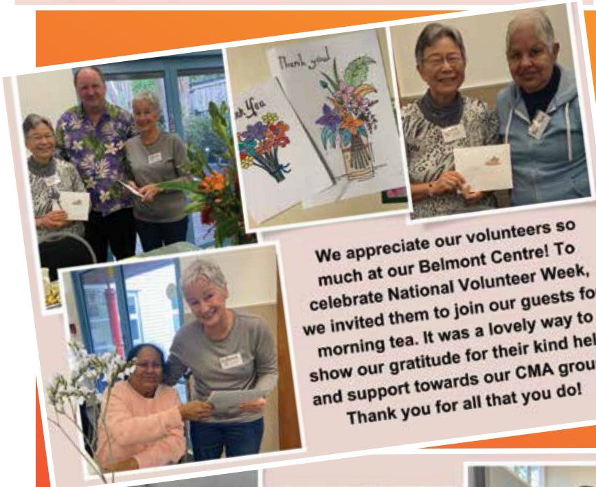
We appreciate our volunteers so much at our Belmont Centre! To celebrate National Volunteer Week, we invited them to join our guests for morning tea. It was a lovely way to show our gratitude for their kind help and support towards our CMA group. Thank you for all that you do!